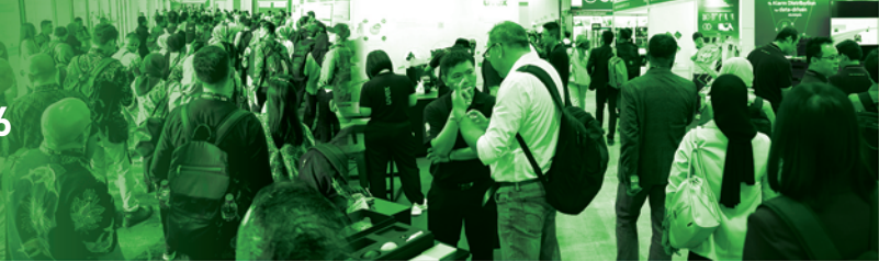
Exhibit and be that Game-Changer in Workplace Safety & Health